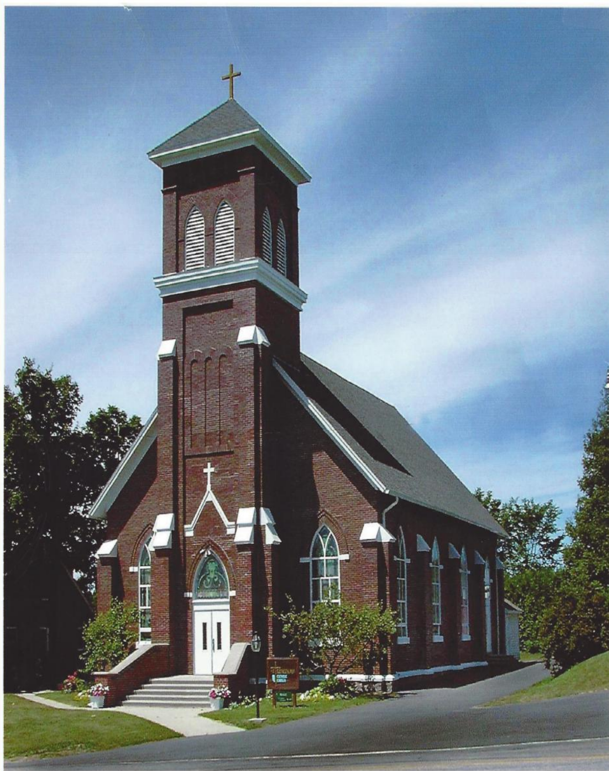
St. Wenceslaus Catholic Church