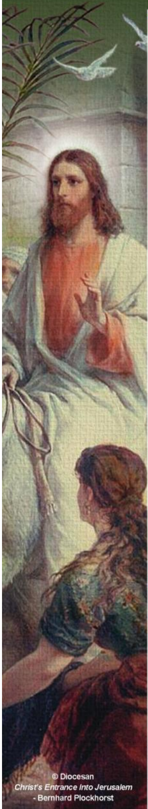
© Diocesan Christ's Entrance Into Jerusalem - Bernhard Plockhorst